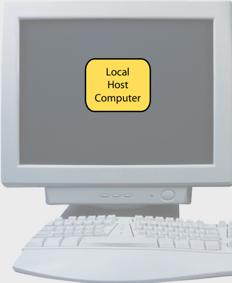
Local Host Computer

Connect the USB Mini-B connector to the USB connector on the cradle.